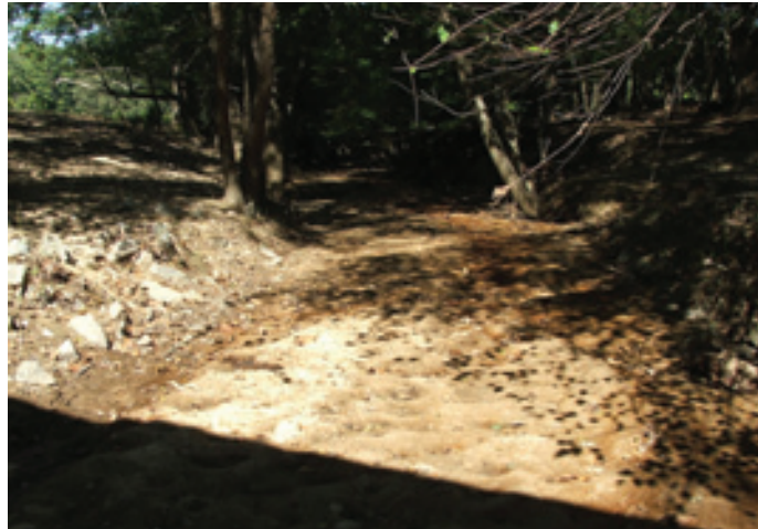
Hollow Creek becomes Dry Creek this summer.

There is a natural mitigating factor impacting the level of fecal contamination that reaches Lake Murray from Hollow Creek. There is a mature forested buffer area at least 1000 feet in depth between the last cattle pasture and Lake Murray. Even though fecal coliform levels have been quite high in the vicinity of the cattle pastures, levels do not exceed freshwater standards where Hollow Creek empties into Lake Murray. The Lake Murray Association is continuing to conduct water quality testing. The fecal coliform level at the mouth of Hollow Creek this September was almost below detection.