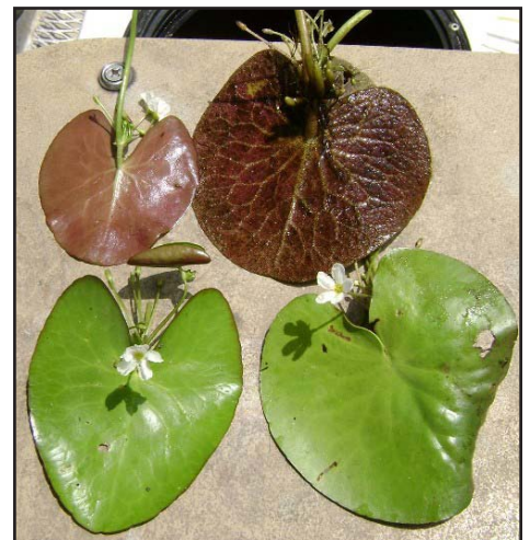
Crested floating heart is on the left and Banana lily is on the right.

Please be especially careful to clean boats thoroughly when moving from waterways infested with crested floating heart to avoid spreading it to non-infested areas.