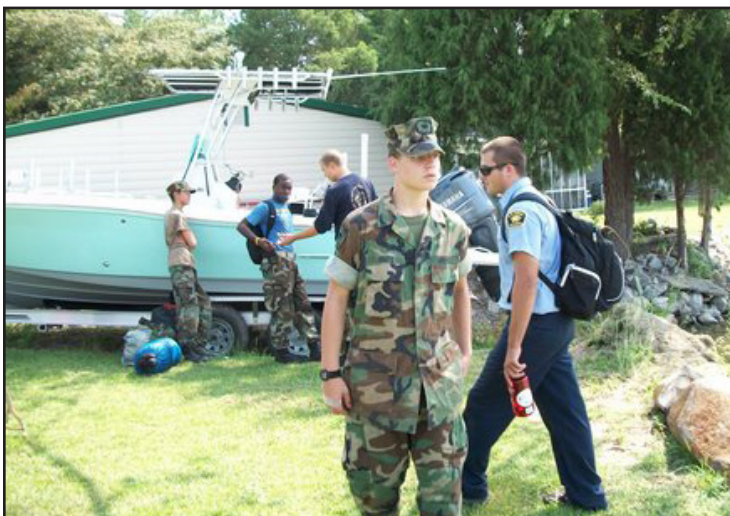
Sea Cadets practiced survival training on Lake Murray.

Most recently the cadets were bestowed another honor. On September 30th they were requested by the Medal of Honor Committee to assist in the Medal of Honor Reunion which was held on the USS Yorktown in Charleston, SC. No other Sea Cadet Division in the United States has ever been asked to assist with the reunion. Congratulations to the young ladies and gentlemen for a job well done!